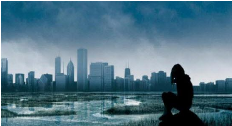
Divergent : Future Chicago

Mass Effect : Future/parallel Earth as well as other planets.